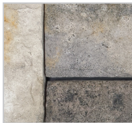
NEW ENGLAND BLEND