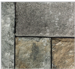
WARM GRANITE BLEND