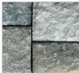
COOL GRANITE BLEND