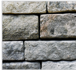
COOL GRANITE BLEND