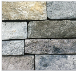
NEW ENGLAND BLEND