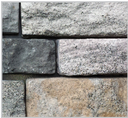
WARM GRANITE BLEND