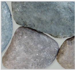
WARM GRANITE BLEND