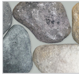
NEW ENGLAND BLEND