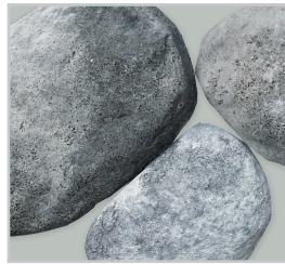
COOL GRANITE BLEND